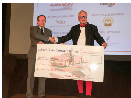
MISTER BLAKE FOUNDATION $5,000 DONATION