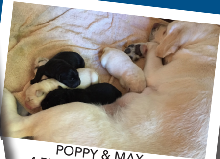
POPPY & MAX 4 PUPS - SEPT 26, 2017