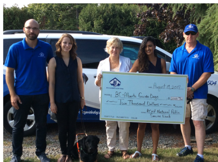
RCMP PUBLIC SERVICE WEEK $2,000 DONATION