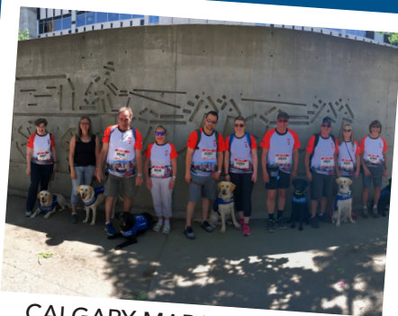
CALGARY MARATHON TEAM CALGARY, AB - RAISED $6,725