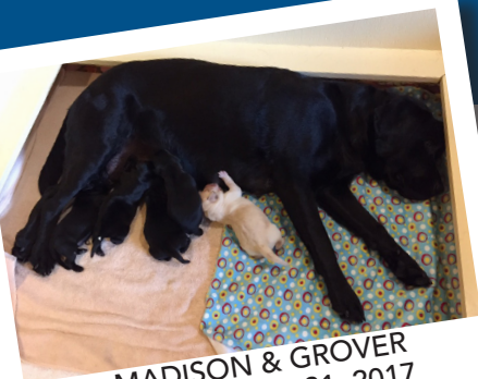
MADISON & GROVER 5 PUPS - JULY 31, 2017

These pups are currently living with their Volunteer Puppy Trainers in Vancouver, Victoria and Calgary! Puppy training is a full-time volunteer job, and is fundamental to our success. We want to say a heartfelt THANK YOU to all our amazing volunteer breeders, whelpers, trainers, and boarders for all your time and the loving homes you provide to our pups.