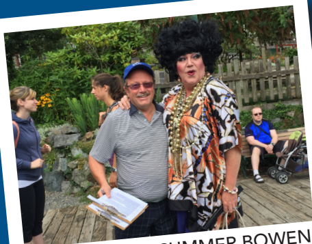
DOG DAYS OF SUMMER BOWEN ISLAND, BC - RAISED $2,200