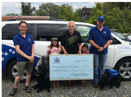
BC MASONIC FOUNDATION $3,000 DONATION