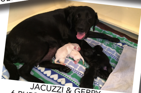
JACUZZI & GERRY 6 PUPS - OCTOBER 20, 2017