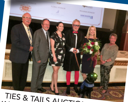
TIES & TAILS AUCTION & GALA VANCOUVER, BC - RAISED $55,000