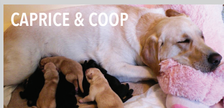
CAPRICE & COOP