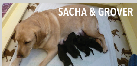
SACHA & GROVER