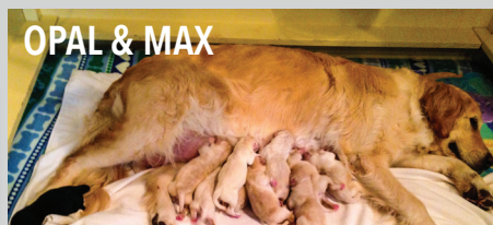
OPAL & MAX