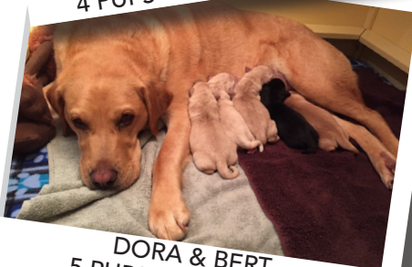
DORA & BERT 5 PUPS - MAY 2, 2017