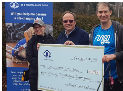
RUGO DASH FOR DOGS $16,000 DONATION