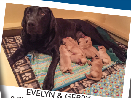
EVELYN & GERRY 8 PUPS - MARCH 21, 2017