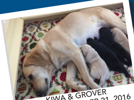
KIWA & GROVER 4 PUPS - NOVEMBER 21, 2016

These pups are currently living with their Volunteer Puppy Trainers in Vancouver, Victoria and Calgary! Puppy training is a full-time volunteer job, and is fundamental to our success. We want to say a heartfelt THANK YOU to all our amazing volunteer breeders, whelpers, trainers, and boarders for all your time and the loving homes you provide to our pups.