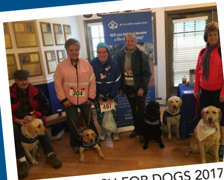
RUNGO DASH FOR DOGS 2017 VANCOUVER, BC