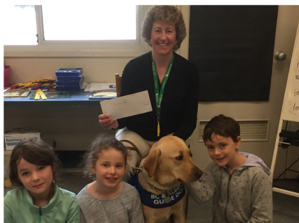
ROSS ROAD ELEMENTARY SCHOOL $106.20 DONATION