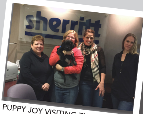
PUPPY JOY VISITING THE SHERITT INTERNATIONAL OFFICE

Sherritt International Corporation is a low-cost nickel producer in Canada. They support community investment opportunities that contribute to the quality of life in communities near their operations, helps them meet their development needs and enables a community of engaged, civic-minded employees and stakeholders. For more than 10 years, they have supported BC & Alberta Guide Dogs and we'd like to thank them for being part of our family.