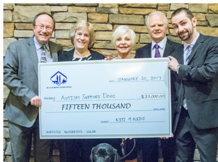
KITS4KIDS $15,000 DONATION