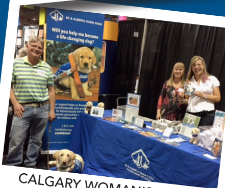
CALGARY WOMAN'S SHOW CALGARY, AB