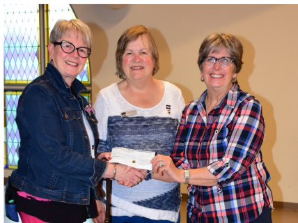
IODE BOUNDARY BAY CHAPTER $500 DONATION