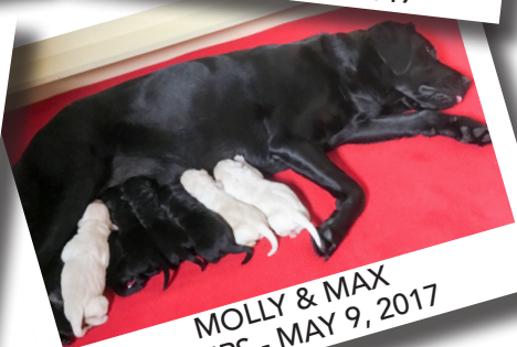
MOLLY & MAX 8 PUPS - MAY 9, 2017