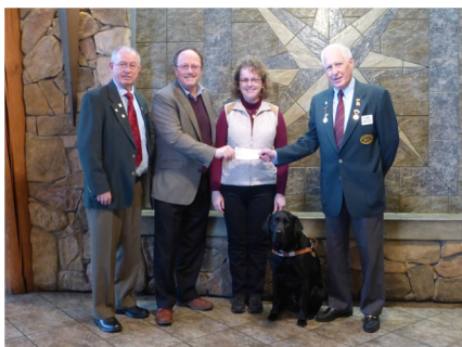
INDEPENDENT ORDER OF ODD FELLOWS BLACK DIAMOND LODGE $500 DONATION