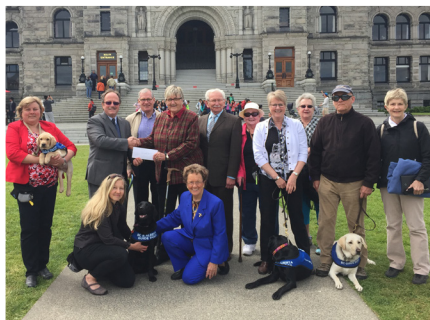
ORDER OF THE EASTERN STAR, OAK BAY CHAPTER $30,000 DONATION