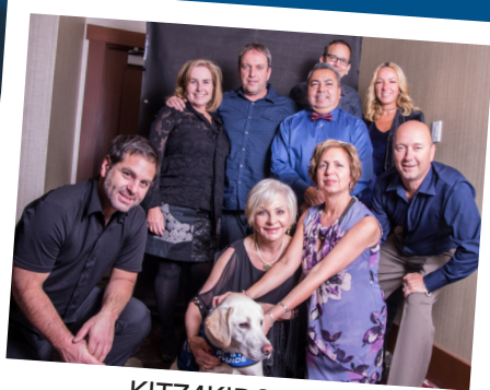
KITZ4KIDS 2017 RICHMOND, BC