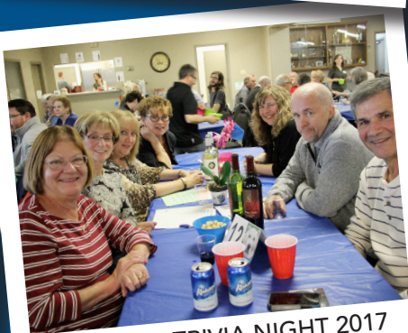
CALGARY TRIVIA NIGHT 2017 CALGARY, AB