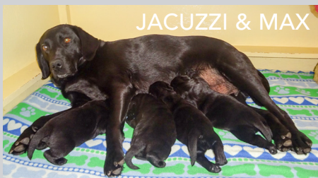
JACUZZI & MAX