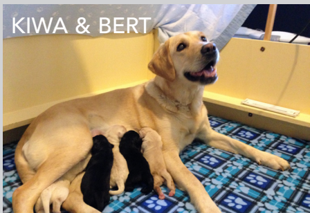
KIWA & BERT

These pups are currently in their puppy training homes in Greater Vancouver, Vancouver Island and Calgary! Puppy training is a full-time volunteer job, and is fundamental to our success. We want to say a heartfelt THANK YOU to all our amazing volunteer breeders, whelpers, trainers, and boarders for all your time and the loving homes you provide to our pups. We couldn't do it without you!