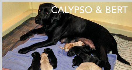
CALYPSO & BERT