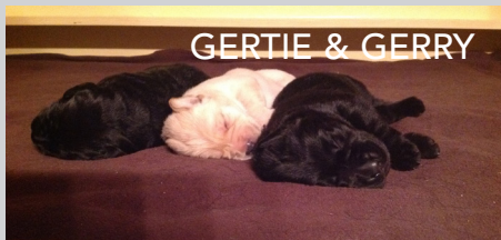
GERTIE & GERRY